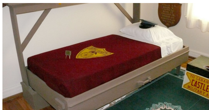
Old Barracks Room Bed Box Displayed in the Alumni House