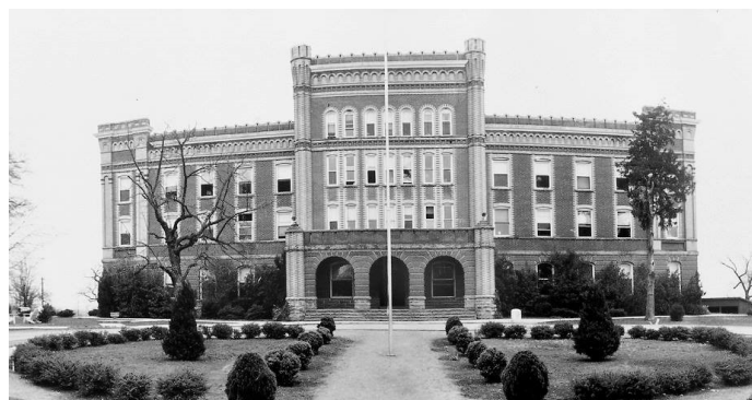
Main Building and the Circle